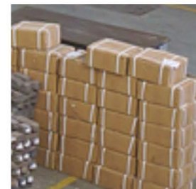
Packing & Dispatch